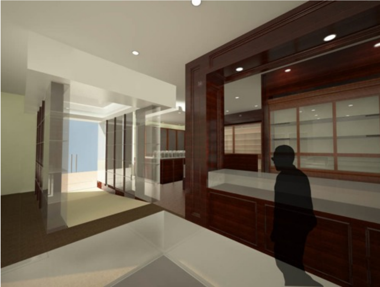
Perspective – Cigar Counters