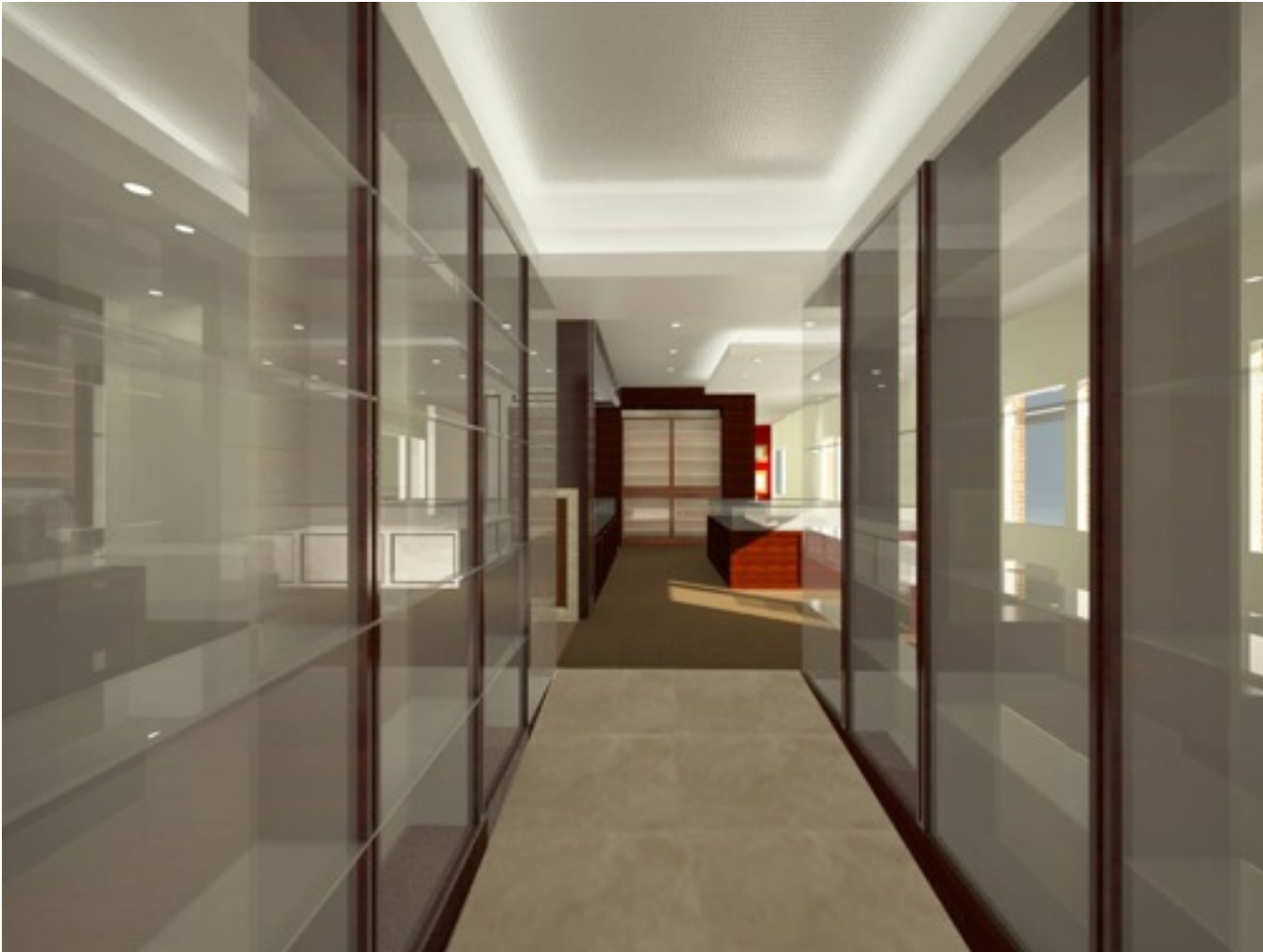
Perspective - Entrance