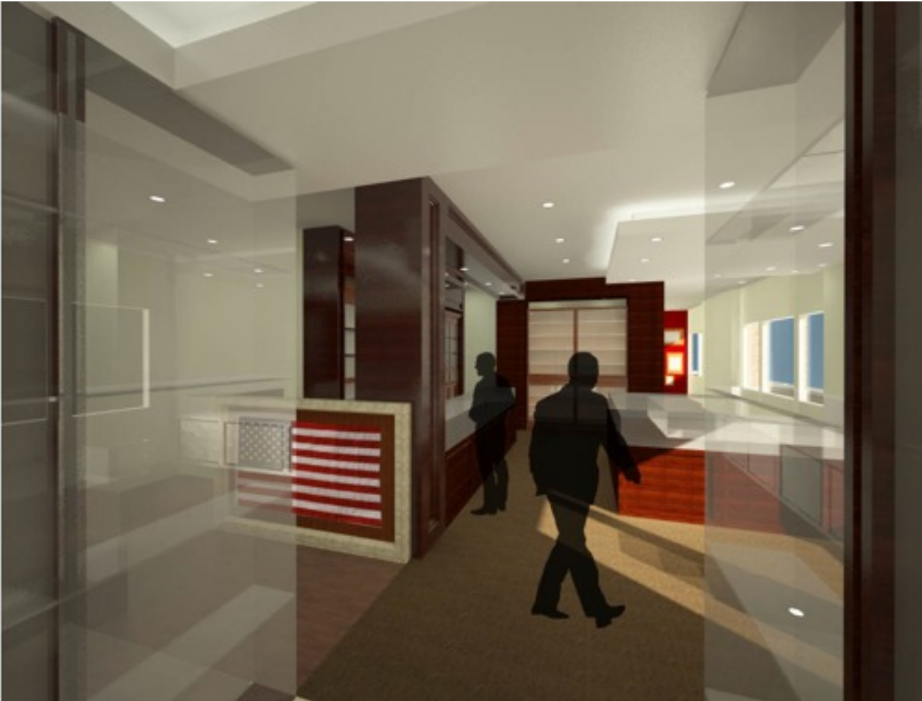
Perspective – Entrance and Cigar Counter