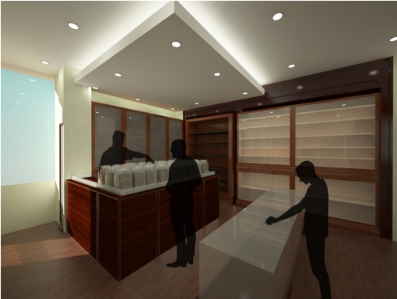
Perspective – Blending Table